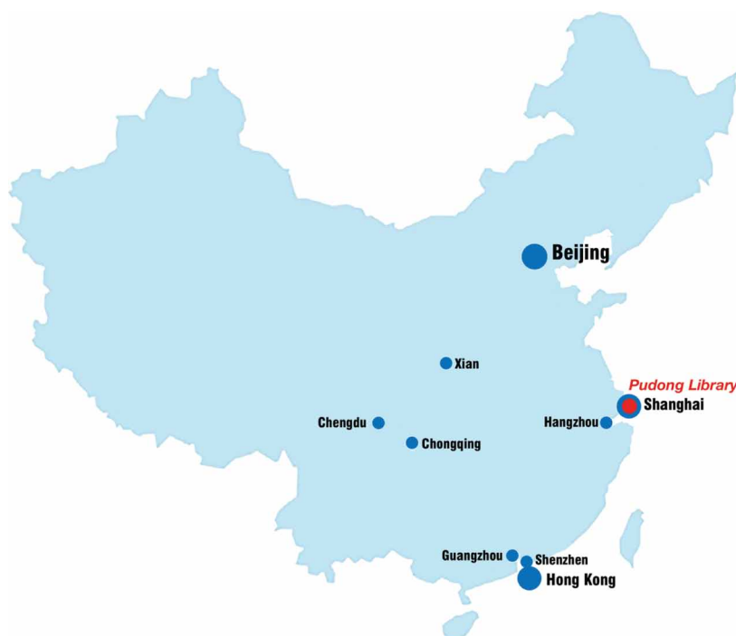
Figure 1. Geographic location of Pudong Library

In the middle of the last century, people realized “for thousands of years the written word and for centuries the printed word have played a vital role in the preservation and transmission of knowledge” (Maheu, 1972). Then, 1972 was proclaimed as the International Book Year by UNESCO’s General Conference, and the year’s slogan was “Books for All”. In 1977, the Library of Congress Center for the Book, which also administered the Poetry and Literature Center, was established by public law. The center promoted books and libraries, literacy and reading, as well as poetry and literature. That is, promoting reading is the heart of the Center for the Book’s mission. To promote books means to improve the literacy of people, and this is especially important for children. Edmonds (1987) stated “the promotion of reading and a commitment to producing a literate population must be central to the provision of library service to children in the coming decade” (Edmonds, 1987). In 1995, UNESCO further proclaimed 23 April the annual World Book and Copyright Day. Then, more and more libraries launched reading programs to promote reading, and there is no doubt that reading promotion is an important service in public libraries through today.